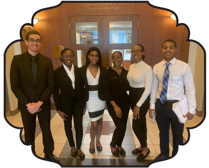
VEI STUDENTS PARTICIPATE IN VARIOUS COMPETITIONS, INCLUDING THE REGIONAL PLAN COMPETITION AT NSU.

Students with an interest in Engineering and Architecture are taking advantage of the Piper Pre-Engineering Program, which covers drafting, engineering, and advanced manufacturing coursework. Students have access to high level technology in all of their classes.