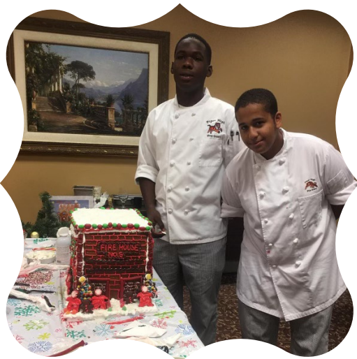
BENGAL CULINARY ARTISTS AT A GINGERBREAD COMPETITION AT THE RIVERSIDE HOTEL

Piper High School Career Pathways are a critical component of the Piper focus on educating the whole child. Our goal is to provide students with extensive opportunities for academic excellence, critical thinking, college preparation, and career readiness.